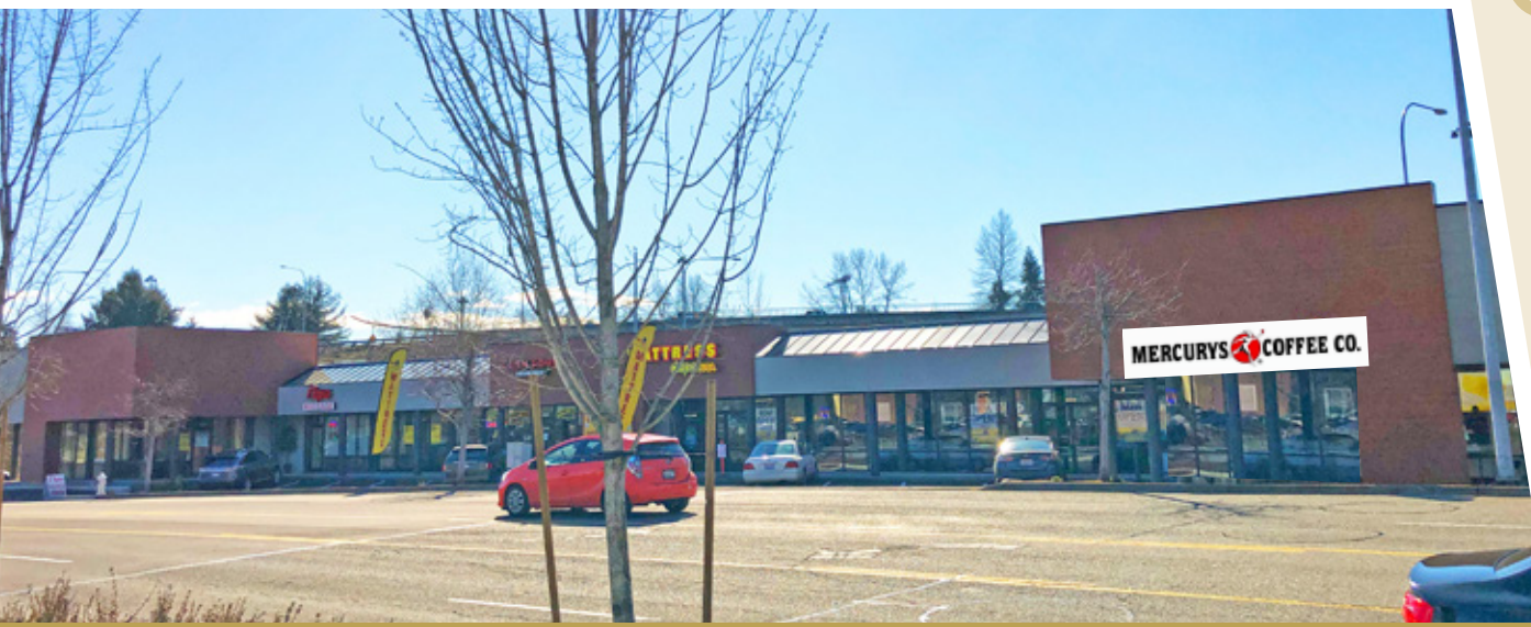
Highly visible location on Totem Lake Blvd NE, directly across the street from The Village at Totem Lake

Fast-growing residential demographics, including Aura at Totem Lake, a 26 acre lifestyle development